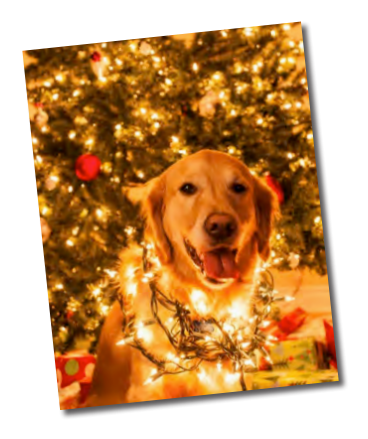
"Golden Lights" card can come WITH a holiday message inside that reads: