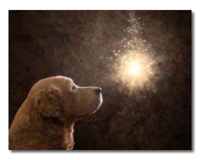
"Star of Wonder" card only remains with no inside message (blank)

Or, if you prefer, you can order all cards WITHOUT a message inside – perfect for sending thank you notes or other general greetings.