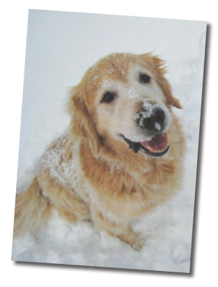
"Let it Snow!" card can come WITH a holiday message inside that reads:

These 5 x 7" professionally printed cards are available in "Let it Snow!", "Golden Lights" or "Star of Wonder".